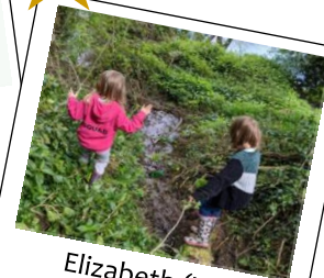
Elizabeth (Y2) learning in the big outdoors during exercise time