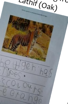
Amazing writing from Lathif (Oak)