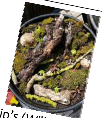
Filip's (Willow) own mini garden design