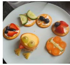
Freddie (Acorns) has made some 'Room on the Broom' inspired crackers