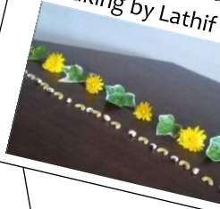
Beautiful repeated pattern making by Lathif (Oak)